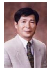
Chan Before he left for Vancouver

Stats, schedule and links can also be followed from the website and be sure to check out the latest photos in the photo section!!!